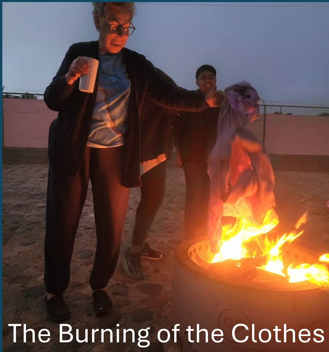
The Burning of the Clothes