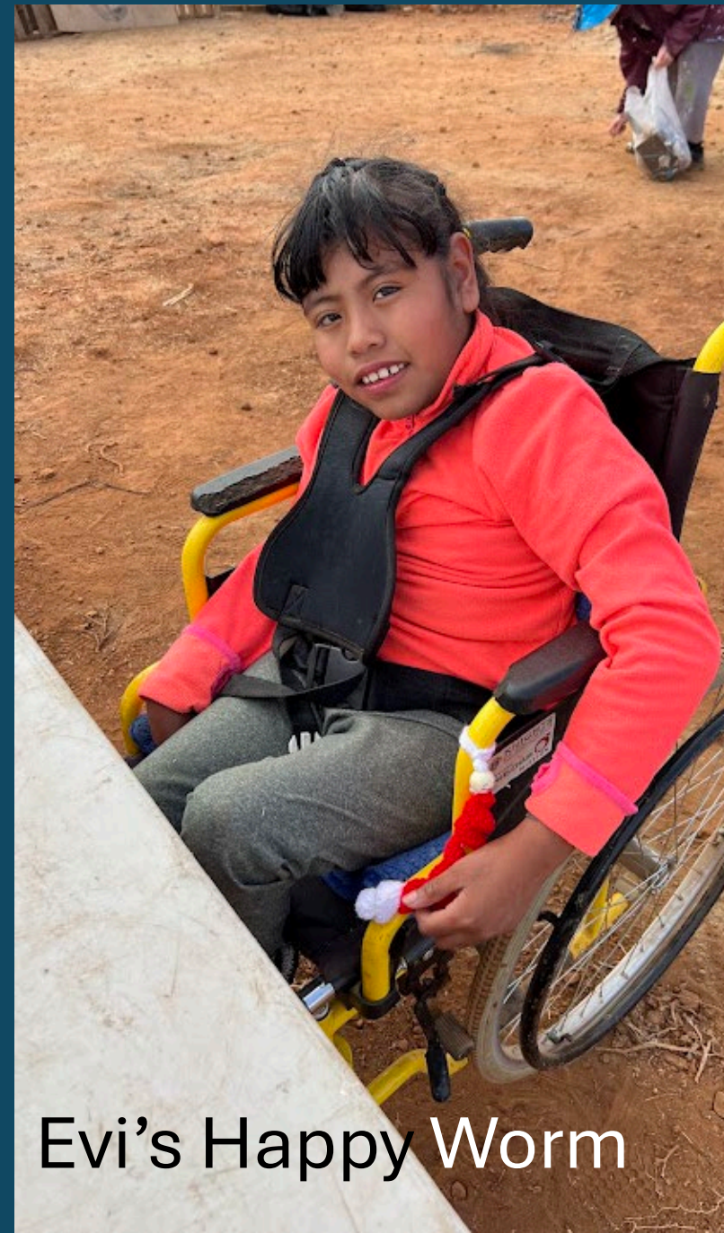
Evi's Happy Worm